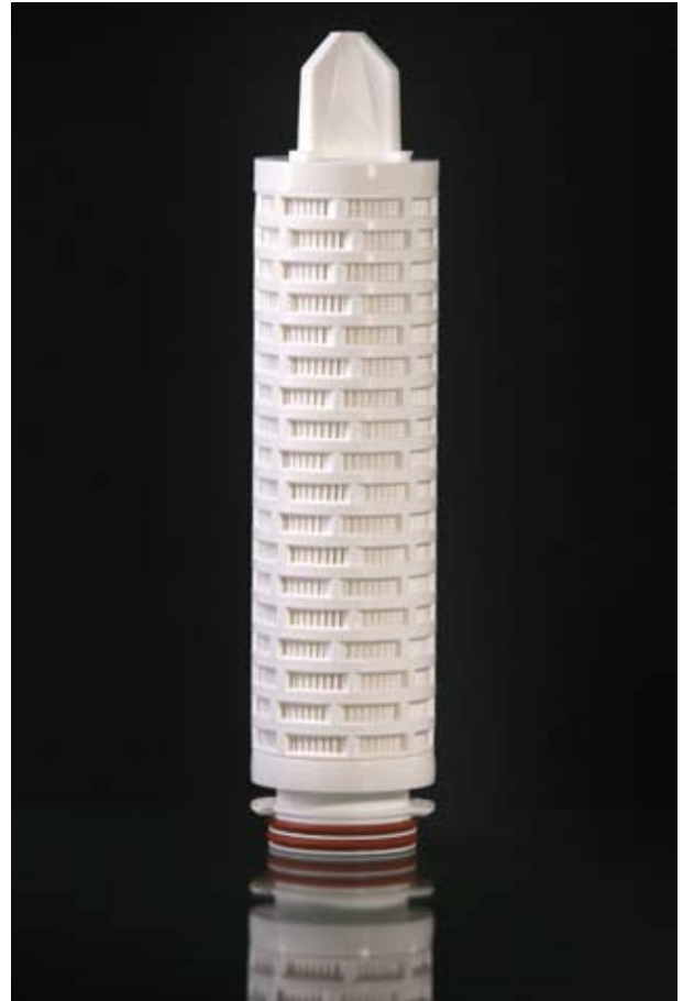
Note: PREPOR is a registered trademark of Parker domnick hunter