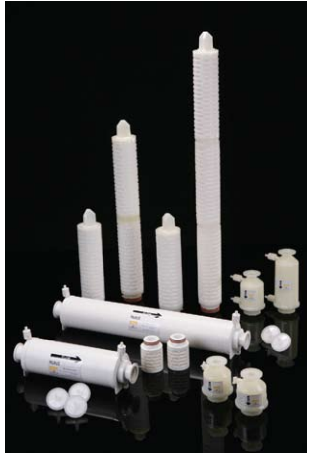
Note: TETPOR is a registered trademark of Parker domnick hunter