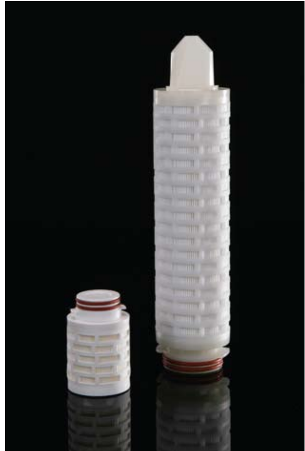
Note: BIO-X is a registered trademark of Parker domnick hunter